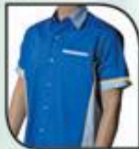
U803 Royal Blue