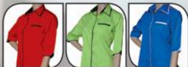
FU701 Red (P/Black)