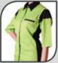
FU402 Apple Green