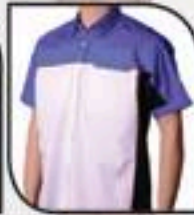
U303 Royal Blue