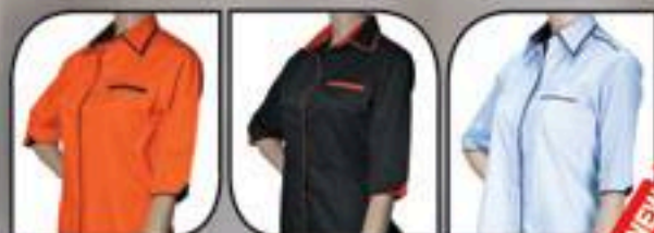
FU704 Orange (P/Black)