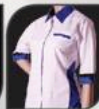
FU503 Royal Blue