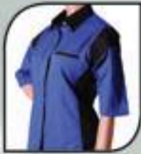
FU403 Royal Blue