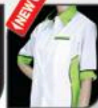
FU502 Apple Green