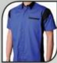
U403 Royal Blue