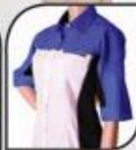
FU303 Royal Blue