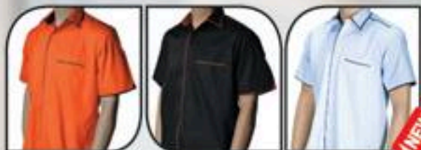
U704 Orange (P/Black)