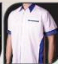
U503 Royal Blue