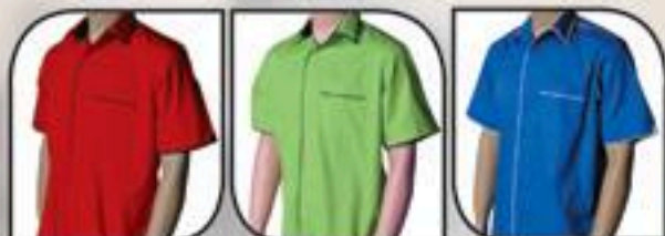
U701 Red (P/Black)