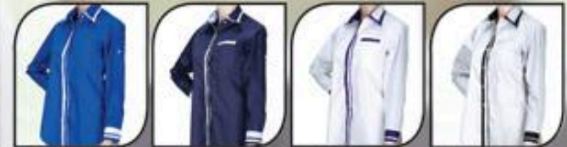
FU1003 Royal Blue FU1006 Navy Blue FU1007 Purple FU1012 Grey