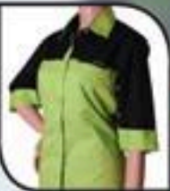
FU202 Apple Green