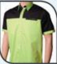
U202 Apple Green