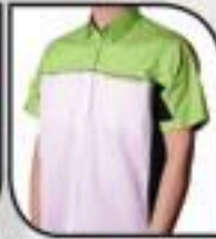
U302 Apple Green