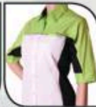
FU302 Apple Green