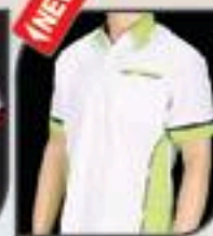
U502 Apple Green