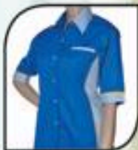
FU803 Royal Blue