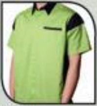
U402 Apple Green