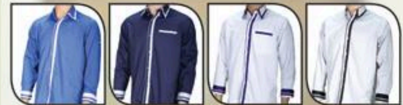
U1003 Royal Blue U1006 Navy Blue U1007 Purple U1012 Grey